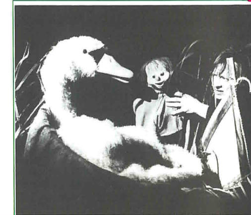
A scene from 'Swans Down' by Theatre Terra

Our postal address is: The Scottish International Children's Festival, 22 Laurie Street, Edinburgh EH6 7AB. Phone: 031-554-6297 (Admin) 031-553-7700 (Box office).